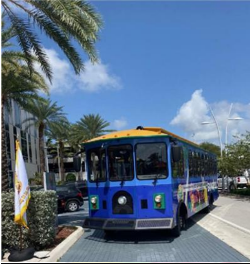
City of Miami Gardens Trolley